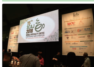
Competition area (event stage) *2

Your company logo will be shown at two special event stages.