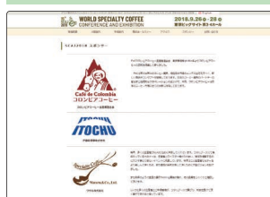
Official website *3

Corporate Logo, 150-words corporate profile and link on the SCAJ2018 website